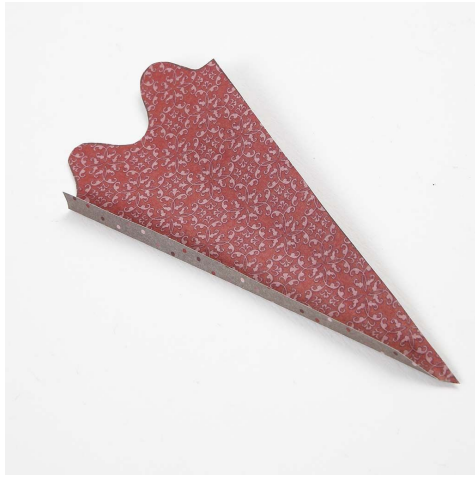
3. Fold the edge of the hat.