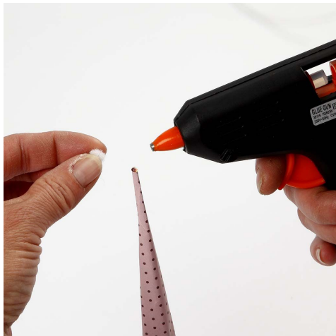
9. Cut off the pointed end of the hat and glue on a pom-pom.