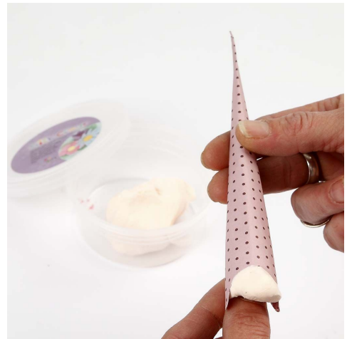
6. Put a piece of Silk Clay inside the hat.