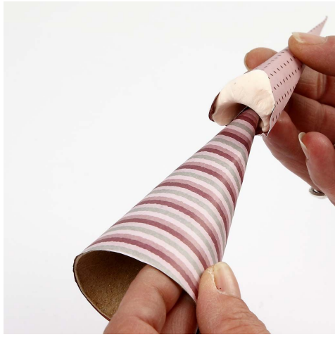
7. Place the hat onto the cone.