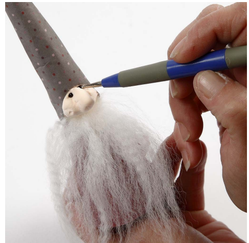
10. Mould the face and attach beads for eyes.