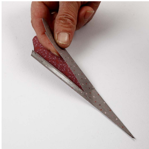
5. Stick the edges of the hat together.