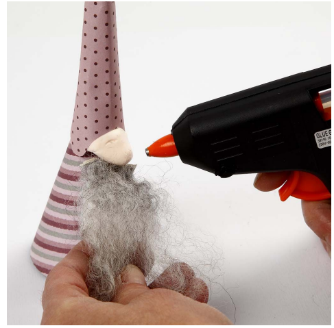
8. Glue on the beard.