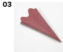
03 Fold the edge of the hat.