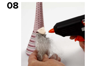
08 Glue on the beard.