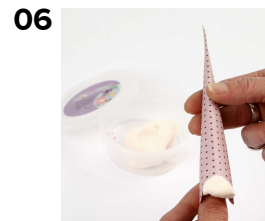
06 Put a piece of Silk Clay inside the hat.