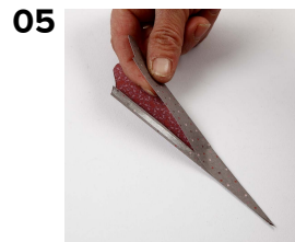
05 Stick the edges of the hat together.