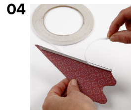
04 Attach double-sided adhesive tape.