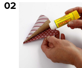
02 Glue the paper onto the cone.