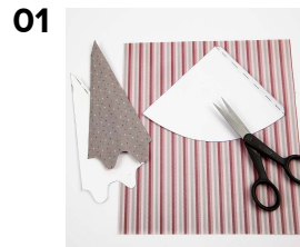
01 Cut out the paper for the cone and the hat using the template.