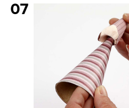
07 Place the hat onto the cone.