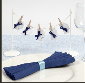
Table Decorations with Nappies on a String for a Christening