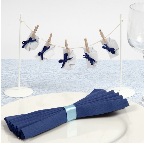
Table Decorations with Nappies on a String for a Christening

Each nappy is cut out from white card using a template and assembled with a satin ribbon. Each nappy is hung with mini clothes pegs on a wash line made from two wooden sticks on stands connected with a cord.