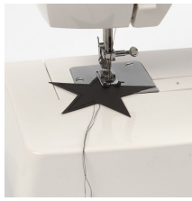
Slowly and carefully stitch along the edge using a sewing machine.