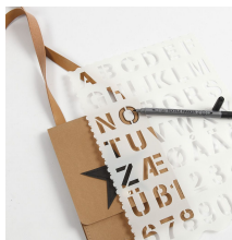
Place the template on top of the bag and copy letters with a textile marker.