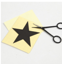
Remove the protective backing paper from the foil, place the star on top and cut out. Remove the other backing paper and stick the star onto the bag.