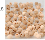
Wooden Beads, D: 5 mm, hole size 1.5 mm, china berry, 100pcs 566600