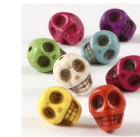
Howlite Beads, D: 12 mm, hole size 1.5 mm, bold colours, skull, 32pcs 69919