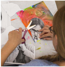
Print a black and white portrait in A4. Cut out around the outer edge.