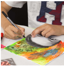
Place the cut-out on the canvas panel and draw the outline onto the canvas panel (just a section of it) with a Uni Posca marker. Leave to dry.