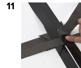
11 Now follow steps 3-11. Always using the paper strip which is placed at the top right.