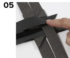
05 Fold the same paper strip towards the left, once again creating a diagonally divided area in the small square.