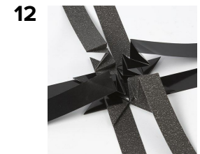
12 An example of the finished folding on all four squares.