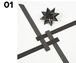
01 A star made from glittery and glossy paper star strips: Place and weave the strips on the table as shown. NB: Cut the ends off slightly diagonally.

These pyramid-shaped stars are woven using glossy and glittery Vivi Gade design paper star strips (the Paris series).