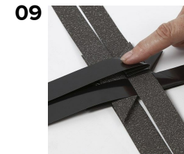
09 Fold diagonally to the left as shown.