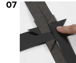
07 Fold down the paper strip once again creating a diagonally divided area in the small square.