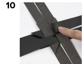
10 Fold the strip from the edge to the right. Now turn the star 1/4 turn clockwise.