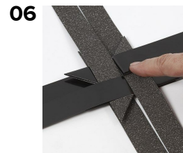
06 Fold the strip so that it's flush with the edge of the small square and place it to the right. NB: Press as you go along to make the creases sharp.