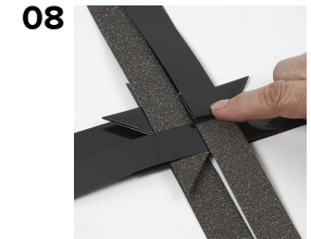
08 Fold the strip up, along the edge of the small square, so that this strip now points upwards.