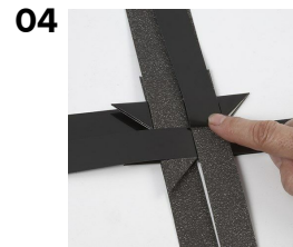
04 Fold the strip up, along the edge of the small square, so that this strip now points upwards.