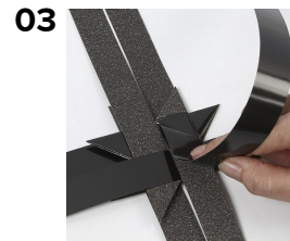
03 Fold down the paper strip at the top right, creating a diagonally divided area in the small square.