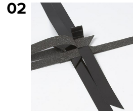
02 Weave the star following the instructions printed on the back of the packaging. However, only up to and including step 12.