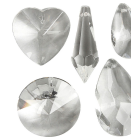
Prisms, size 30-40 mm, hole size 1.2 mm, Gloss transparent, 5mixed 523941