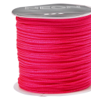
Polyester Cord, thickness 1 mm, neon pink, 28m 41721