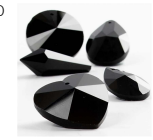
Glass Prisms 523961