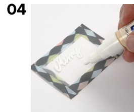
04 Write on the hard foil card.