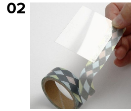
02 Attach one half of the masking tape along the edge of the hard foil.