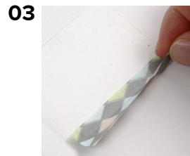
03 Fold the other half of the masking tape around the other side of the hard foil and repeat this and the previous process on the remaining three sides of the piece of hard foil.