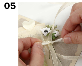
05 Tie flowers and organza ribbon onto the ribbon of the organza bag.