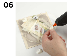
06 Glue satin hearts onto the ribbons.