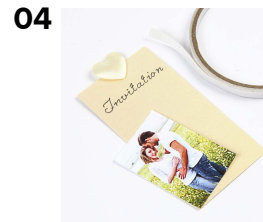
04 Print out a photo and attach it to the card.