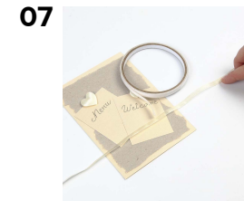
07 For the menu cards, attach the organza ribbon onto the front of the card.