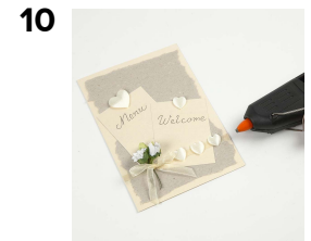
10 Glue satin hearts onto a piece of organza ribbon.