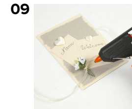
09 Glue the bouquet onto the card.