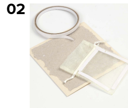
02 Attach the organza bag with double-sided adhesive tape.