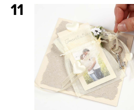
11 Tie a key onto the organza ribbon on the wedding invitation.