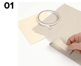
01 Tear the recycled paper to make a square.