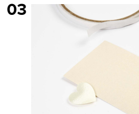
03 Attach a satin heart onto a piece of card.